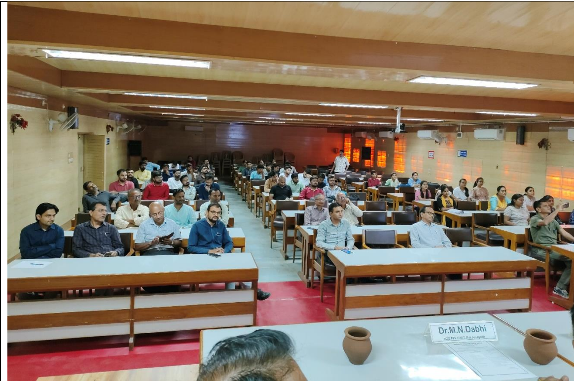
Sudents, faculties and staff participating the event