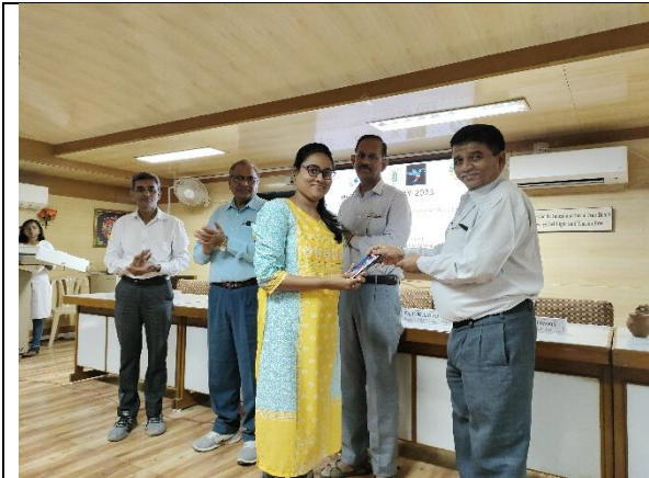
Prize distribution to 1 st , 2 nd & 3 rd winners of elocution competitions by dignitaries