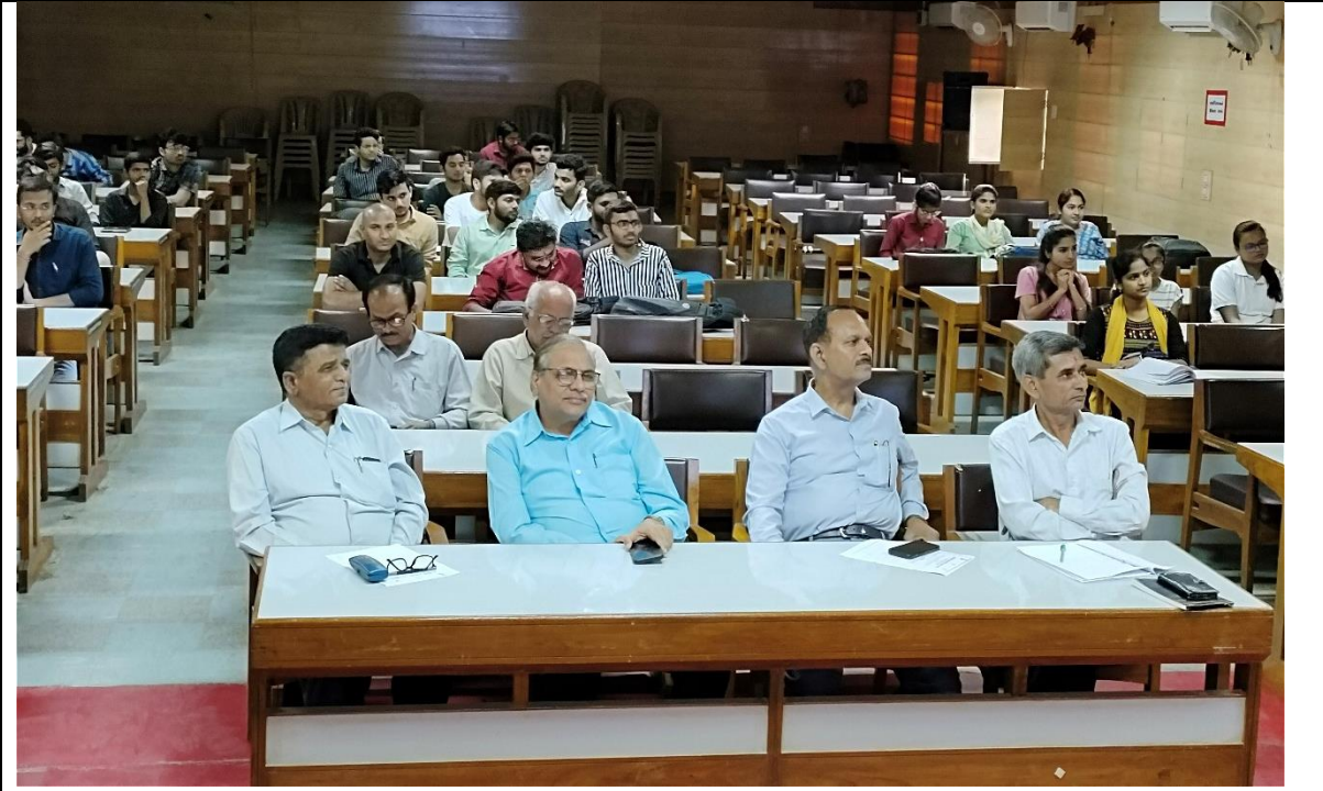
Dignitaries during the elocution competitions among studnets