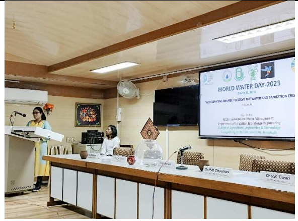
Students participation in elocution competition during the event